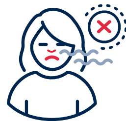
Loss of, or change in taste or smell

If you have symptoms, stay at home, self-isolate and visit www.gov.wales/coronavirus